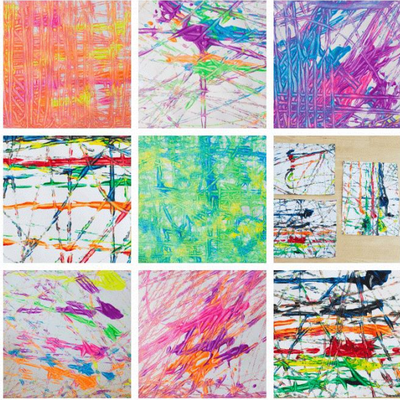
Q for Q-tips