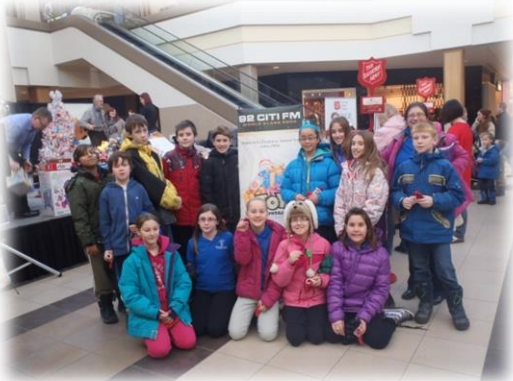
Grade 1-2 field trip to the Narcisse Snake Pits Drive

Field trips are an integral experiential springboard and extension portion of a student's education at BSLs. Each class participates in several outings throughout the year to broaden their interest and experience. An activity fee is collected at the beginning of the year to assist in the continuation of these programs.