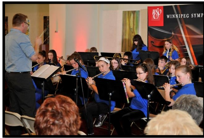
Band performing before WSO concert