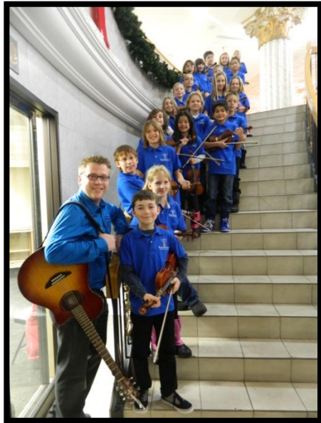
Violins performing at Christkindlmarkt

Admissions Information can be found on our website www.bsls.ca and/or in a registration package when requested.