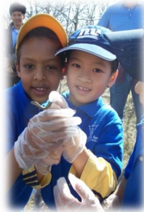
Grade 5-6 field trip to deliver toys to the Salvation Army Toy