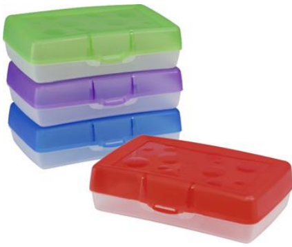
Plastic pencil case